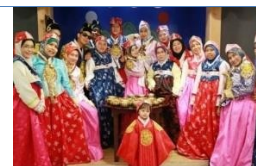
Hanbok Wearing Experience