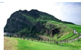
Seongsan sunrise peak