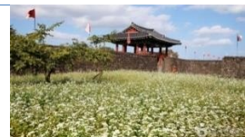
Seongeup folk village