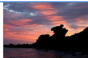
Dragon head rock