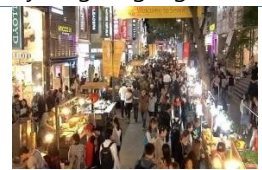
Myeongdong shopping street